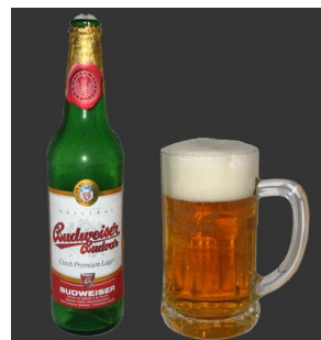
Beer or any Kind of Alcohol

This document was developed with funding from the Bureau of Population, Refugees, and Migration, United States Department of State, but does not necessarily represent the policy of that agency and the reader should not assume endorsement by the federal government.